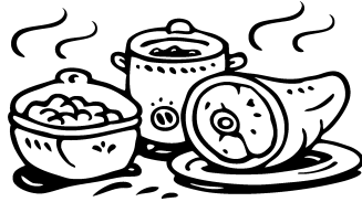
New Member Luncheon April 17 After Worship

Please join us for a covered-dish fellowship luncheon on Palm Sunday, April 17, immediately following morning worship as we welcome Hebron's newest members!